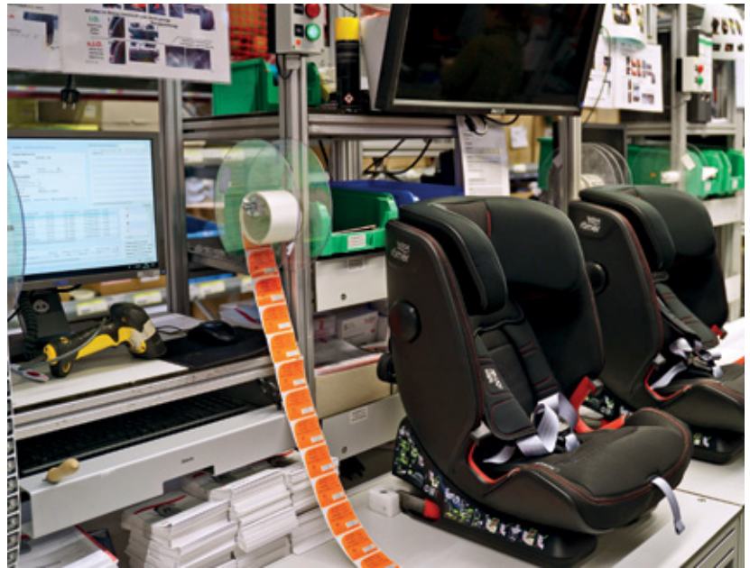
Turck's TBEN-S-RFID interface talks both Profinet with the Siemens PLC as well as Ethernet/IP as an interface to Labview on the rework station

does not initially sound spectacular but this form of production tracking system has never been implemented before. Tracking systems normally only use the ID of the tag and save the associated production data in a database, which can be accessed from all relevant process points. However, Kirschenhofer wanted to save its customers from this type of server infrastructure – after all, every dealer should also be able to access the database. A decentralized system without a permanent data link and without a PLC has its advantages: firstly, the mobility and independence provided, and secondly the lower costs. The limited storage capacity of the tags is one small restriction. Only the relevant information and features could be stored.